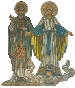
Our Lady & St Columba Wallsend