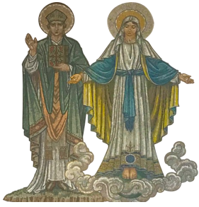
Our Lady & St Columba