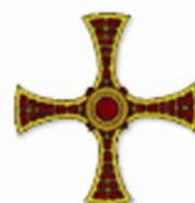
Diocese of Hexham and Newcastle